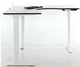
90 Degree/Right Angle Desk