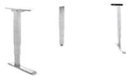
120 Degree Desk