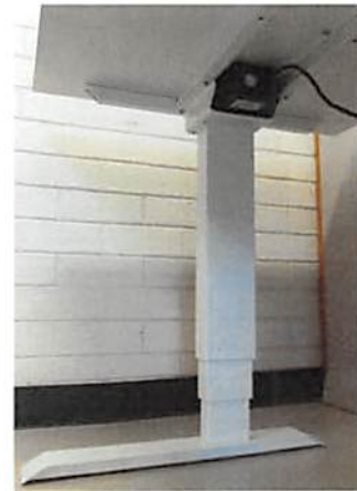
Leg and worksurface attachment brackets